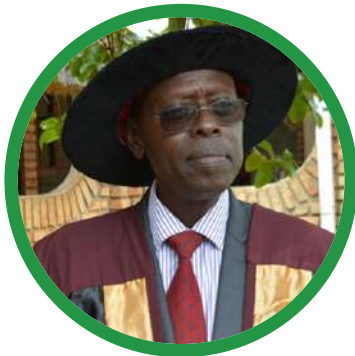
Hon. Justice Ezekiel Muhanguzi, CHANCELLOR